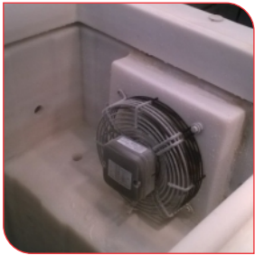
Inner & Outer Plastic Body