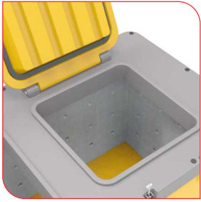
Plastic Inner Tank