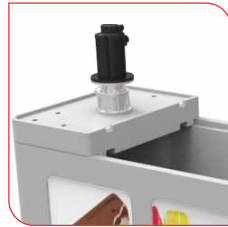
Motor with Gear Box