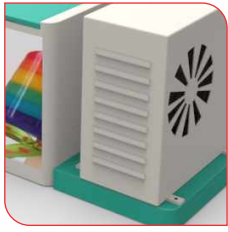
Pallet for mounting