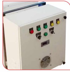
With Electric Panel